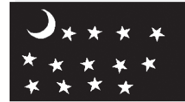
4 th MO Infantry

Registration is 5:00 PM to 5:30 PM. Meal time is 5:30 PM to 7:00 PM The dance is from 7:00 PM to 11:00 PM or until the band/caller wears out.